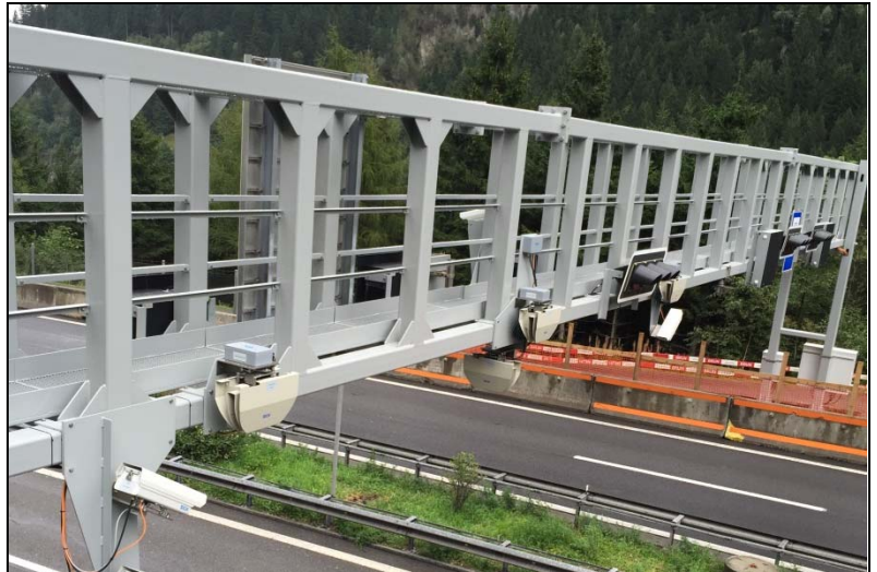
Sensor system of the Göschenen "thermo" portal