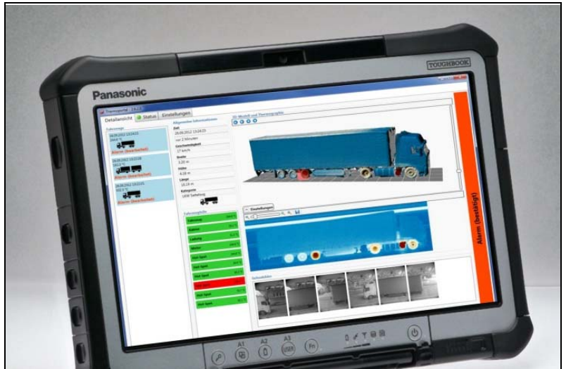
Mobile terminal to display alarms